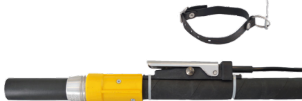
1203010 E-DMH Premium