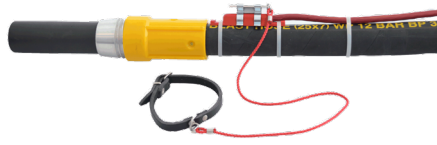
1203011 E-DMS magnetic with clip